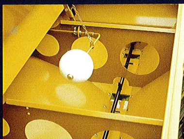
Extra large capacity seed box with seed agitator