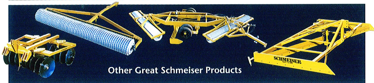
Other Great Schmeiser Products